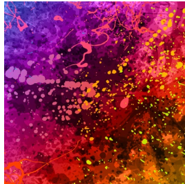
Out & Allies