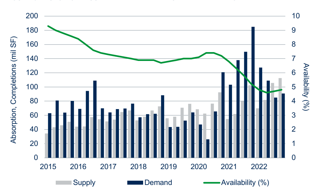
FIGURE 5: HISTORIC INDUSTRIAL DEMAND KEEPS AVAILABILITY LOW

Consumption trends as well as longer-term tailwinds supported by e-commerce and functional obsolescence remain intact, which reinforce both the space and capital markets outlook for the industrial property type. The pervasiveness of these trends has led to robust demand growth outside of the largest metros especially in secondary coastal and inland port markets.