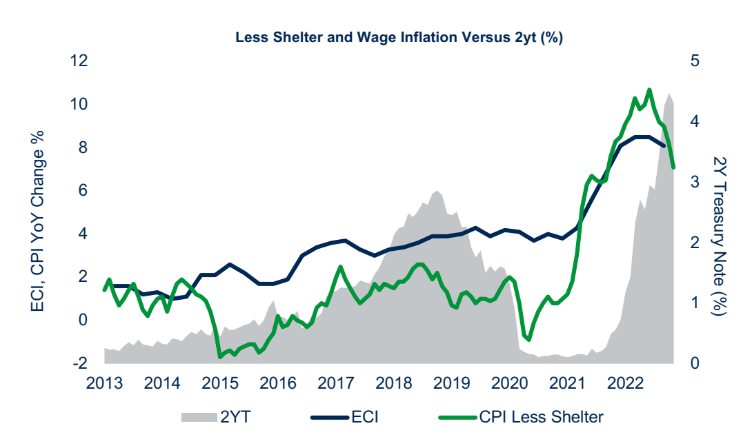
FIGURE 1: STILL MORE WORK TO BE DONE BEFORE INFLATION IS TAMED

U.S. property fundamentals are softening as rising interest rates weigh on the broader economy and financial markets. Inflation has trended positively over the past two quarters, leading to increased optimism that the U.S. Federal Reserve (Fed) will be able to bring inflation under control. Monetary tightening is slowing down economic activity, but with unemployment at 3.5%, the labor market is historically low and, consequently, supportive of wage growth. We believe it is wise to take the Fed at its word that it will continue to keep monetary policy tight until inflation in all its forms is decisively lower. This time around the probability is low that we will see anything resembling the stimulus-driven "re-opening" surge the U.S. experienced as COVID-related lockdowns were lifted.