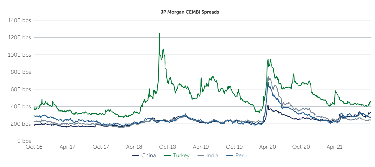
Figure 3: High Yield Segment of EM Looks Attractive

In terms of opportunities, we believe the high yield segment of the market looks quite attractive. While it's come in a bit, the spread differential between investment grade and high yield continues to look wide relative to the long-term average. Within the high yield segment, we have continued to see opportunities arise on the back of volatility in countries like Brazil, Ukraine and Turkey. Often, these pockets of volatility cause corporate spreads to widen beyond what fundamentals would suggest, creating opportunities to identify solid, globally diverse issuers at attractive prices. But like Martin said, we see benefits of flexible mandates that look across asset classes in the public fixed income market, which we believe can help investors capitalize on opportunities as they arise, through 2022 and beyond.