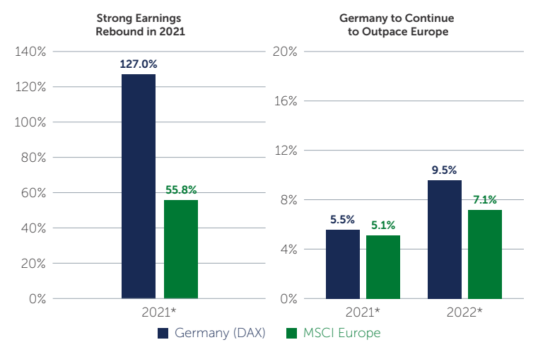
FIGURE 2: Strong Earnings Growth Over the Medium Term

As of September 2021. Relative PE: Index returns in based on DAX vs MSCI Europe.