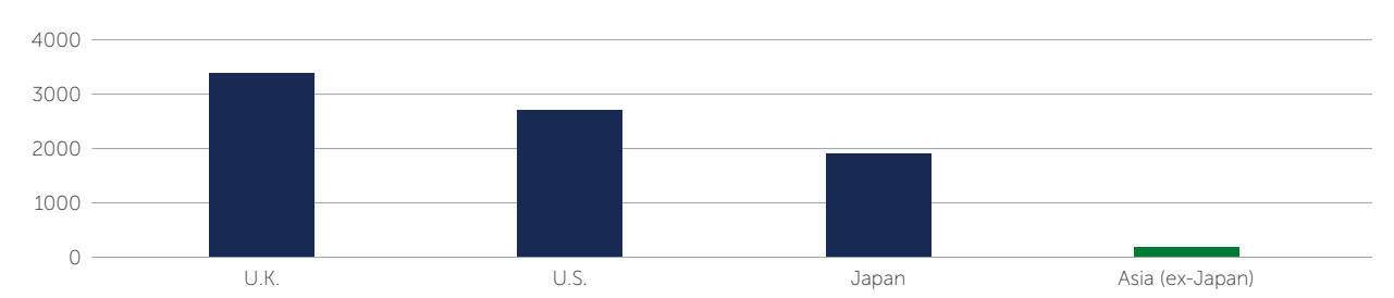
FIGURE 4: Insurance: Premiums Per Capita (U.S.$)

The insurance sector is a prime example. Consumers are increasingly buying high value assets like cars and homes, and with them, the insurance products to protect these assets. The lack of public health care has also led to demand for health and life insurance products. Looking at current penetration levels, insurance premiums per capita in EMs are low (FIGURE 4). In our view, insurance companies that are adapting to this demand stand to benefit, particularly those using AI to collect and analyze data, to price risk and to cross-sell to consumers.