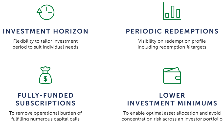
Figure 1: Key Fund Attributes

The next wave of private asset adoption within Europe will be underpinned by individual investors, who have clear and distinctive preferences for accessing private assets: open-ended fund structures, periodic liquidity, and fully-funded subscriptions.